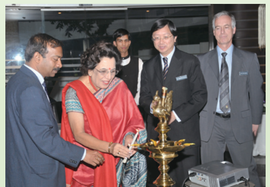
Inauguration Ceremony at the HKU India Liaison Office