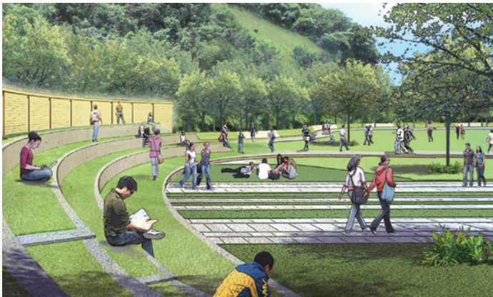
Bricks Wall at the Centennial Campus