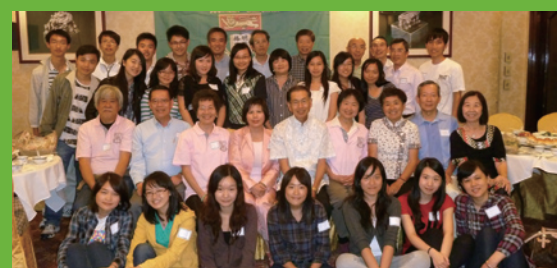
Welcome luncheon for 2010 HKU Exchange Students