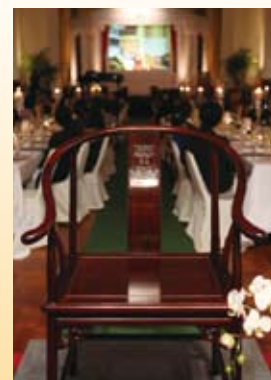
The Endowed Professorships Commemorative Chair is personalized with a customized plaque engraved with the name of the Endowed Professorship

The goal is to establish a total of 100 endowed professorships to coincide with the celebration of the University's 100th anniversary. Your support is particularly significant; contact us and set up your Endowed Professorships!