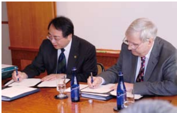
President Lap-Chee Tsui signing an academic partnership agreement with Professor Peter Goddard, Director of Institute of Advanced Study

An HKU academic delegation, led by Professor Lap-Chee Tsui, visited the East Coast of the U.S. in March 2009. This visit included meetings with Presidents and leading academics at Ivy League universities and institutes: Princeton University, University of Pennsylvania, Columbia University, Massachusetts Institute of Technology and Harvard University. The delegation also visited HKU alumni and friends in Toronto and New York.