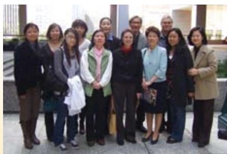
Welcome to the newly launched HKU Alumni Association Washington State!