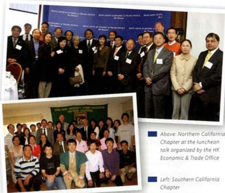
Above: Northern California Chapter at the luncheon talk organized by the HK Economic & Trade Office

The delegation also met the alumni chapters during the visits and updated them on the future developments and directions of the University.