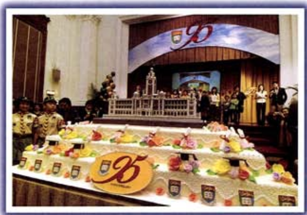
The 95 lb birthday cake was specially designed for the occasion.

In 2011, The University of Hong Kong will mark the Centenary of its incorporation. This year marks the 95th Anniversary which was celebrated with a birthday party held in Loke Yew Hall.