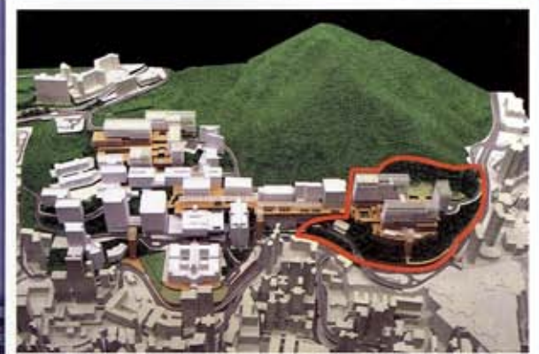
Site of the Centennial Campus