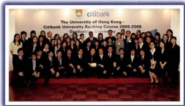
In May the Graduation Ceremony for students of this banking course was held

Funded by the Citigroup Foundation, The University of Hong Kong – Citibank University Banking Course 2005-2006 is a structured banking course which offers students not only valuable knowledge of today's banking industry, but demonstrates how this knowledge can be applied in real life.