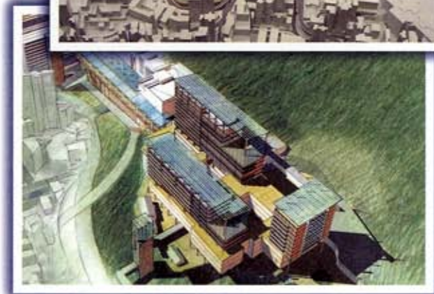
The concept design model by Wong & Ouyang (HK) Ltd/ Sasaki Associates, Inc.