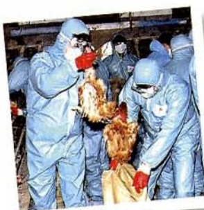
■ HKU is at the forefront in the battle against avian flu and other emerging infectious diseases