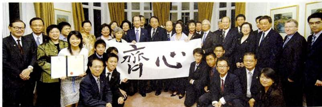
■ “One Heart, One Family” – alumni representatives of various classes come forth to pledge their support to HKU during the launch