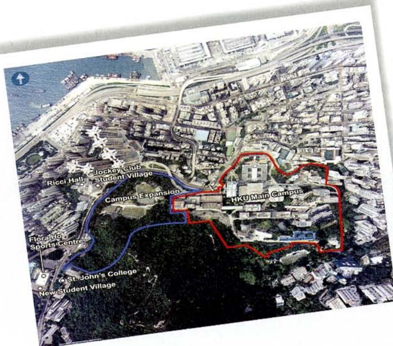
■ The University will develop its physical campus westward with a 30% increase in size

The Blueprint is a work-in-progress, the Vice-Chancellor calls on the alumni, faculty, staff, students and the community to give views and suggestions to shape the future of HKU!