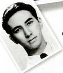
■ Stanley Ho as student, 1940