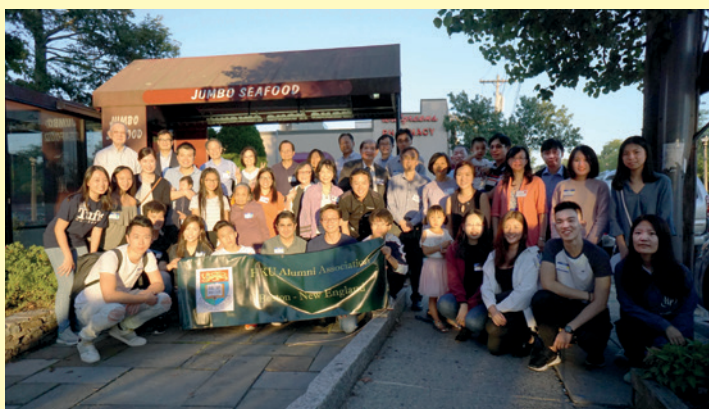
Held in September 2018, this heart-warming fall dinner was well-attended by students, alumni and family members.