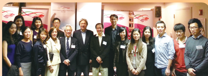
Members of the New York Chapter with HKSAR Financial Secretary John Tsang at a reception hosted by the Hong Kong Economic & Trade Office New York