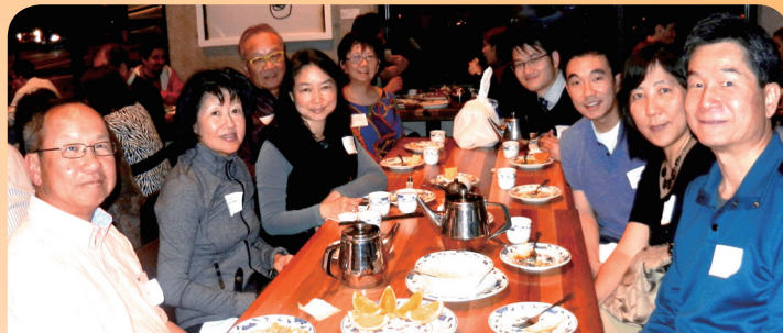
Annual Spring Banquet of the Northern California Chapter