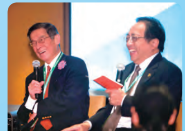
A Dialogue: Dr. Y W Kan and Professor Lap-Chee Tsui