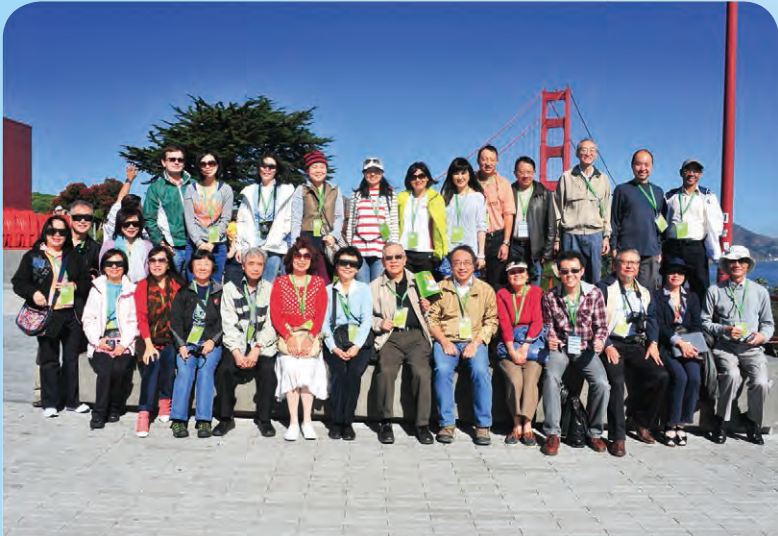
San Francisco Cultural Tour