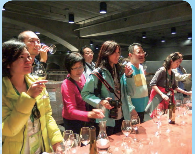
Napa Valley Winery Tour